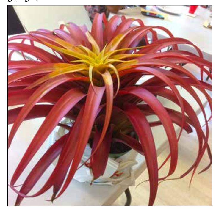
An example of a very unhealthy leaf, with both fungal and insect damage, and a very healthy Tillandsia capitata rubra.